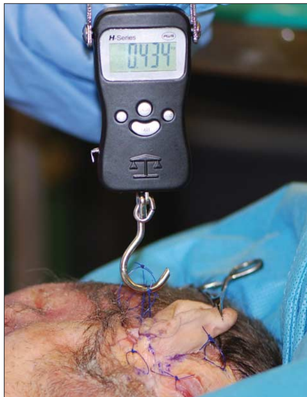
Figure 1. The digital scale was hooked to each suture, 1 at a time, and pulled upward. The maximum weight used to tear the tissue at each suture site was recorded.

suture was placed over the root of the zygoma or the mastoid periosteum, the needle was scraped on bone to ensure a bite of the periosteum. The direction of pull was maintained perpendicular to the plane of the face in a slow, continuous force. The vector chosen was perpendicular to the face in an effort to standardize the vector on each cadaver head. While this vector is not the same used in a face-lift, it does allow for a means to compare tearing force between different areas and different cadaver heads. A digital hanging scale (H Series Electronic Hanging Scales; American Weigh Scales, Charleston, South Carolina) was used to measure the tearing force. We defined the tearing force of the tissue as the force required for the suture to tear through the tissue. We used a tapered needle and strong suture material, 0 Prolene (Ethicon Inc, Somerville, New Jersey), to test the force of the tissue rather than the breaking strength of the suture being placed. Figure 1 demonstrates how the scale was used to measure tearing weight necessary to break through tissue.